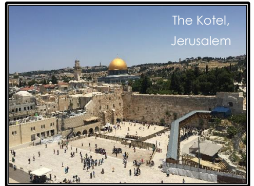
The Kotel, Jerusalem