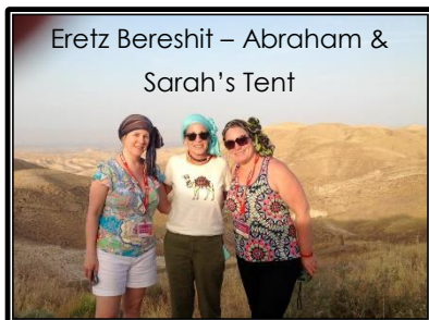
Eretz Bereshit – Abraham & Sarah's Tent