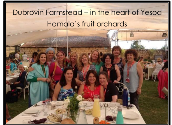
Dubrovin Farmstead – in the heart of Yesod Hamala's fruit orchards