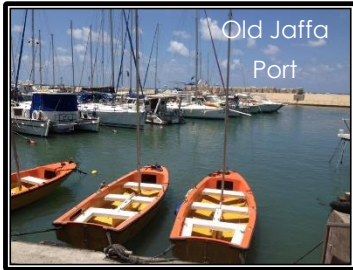
Old Jaffa Port