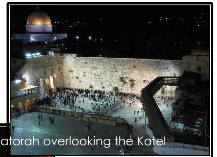
Havdala from Aish Hatorah overlooking the Kotel