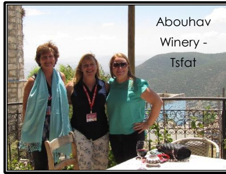
Abouhav Winery - Tsfat