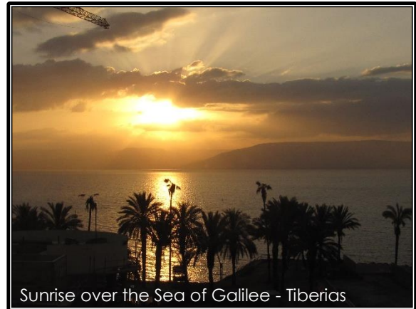
Sunrise over the Sea of Galilee - Tiberias