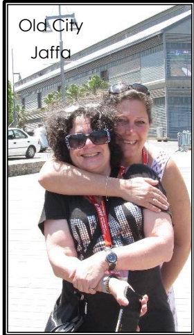
Old City Jaffa